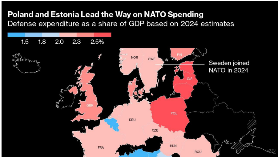
Figure 2. Defence expenditure of European states of the NATO - 2024

Source: Dudik, A., Hornak, D., Ojewski, N., Tammik, O., 2024. Eastern Europe's $70 Billion Frenzy to Plug Defense Spending Gap [online]. Available at: https://www.bnnbloomberg.ca/business/company-news/2024/10/09/defense-spending-frenzy-in-natos-east-jumps-to-70-billion [accessed: 08.11.2024]